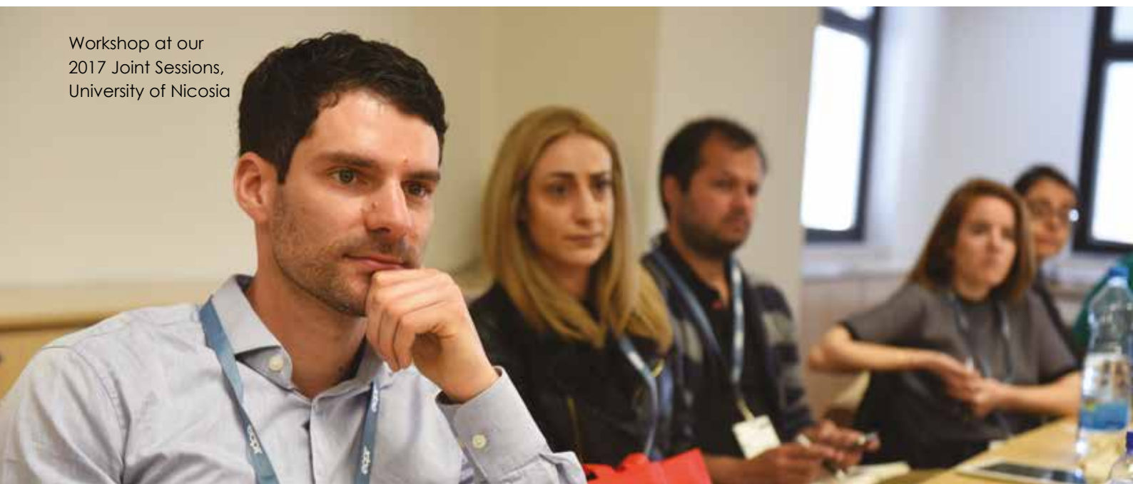
Workshop at our 2017 Joint Sessions, University of Nicosia

Over the last five years there has been a core of 274 institutions which have maintained consistent membership year on year. An additional 106 institutions have had inconsistent membership during that time, meaning that there has been a total of 380 institutions who have been ECPR members over the last five years. Of these, there are 43 who are not members in the 2017–18 year.