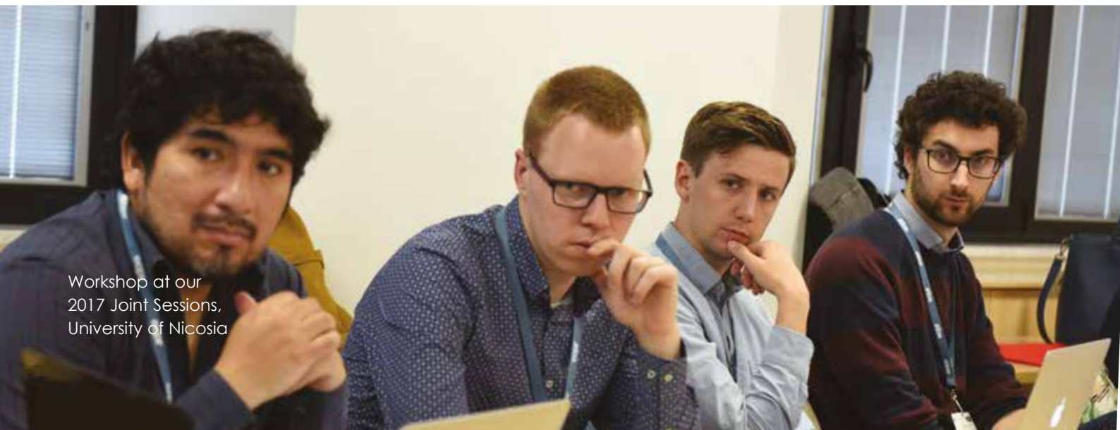
Workshop at our 2017 Joint Sessions, University of Nicosia