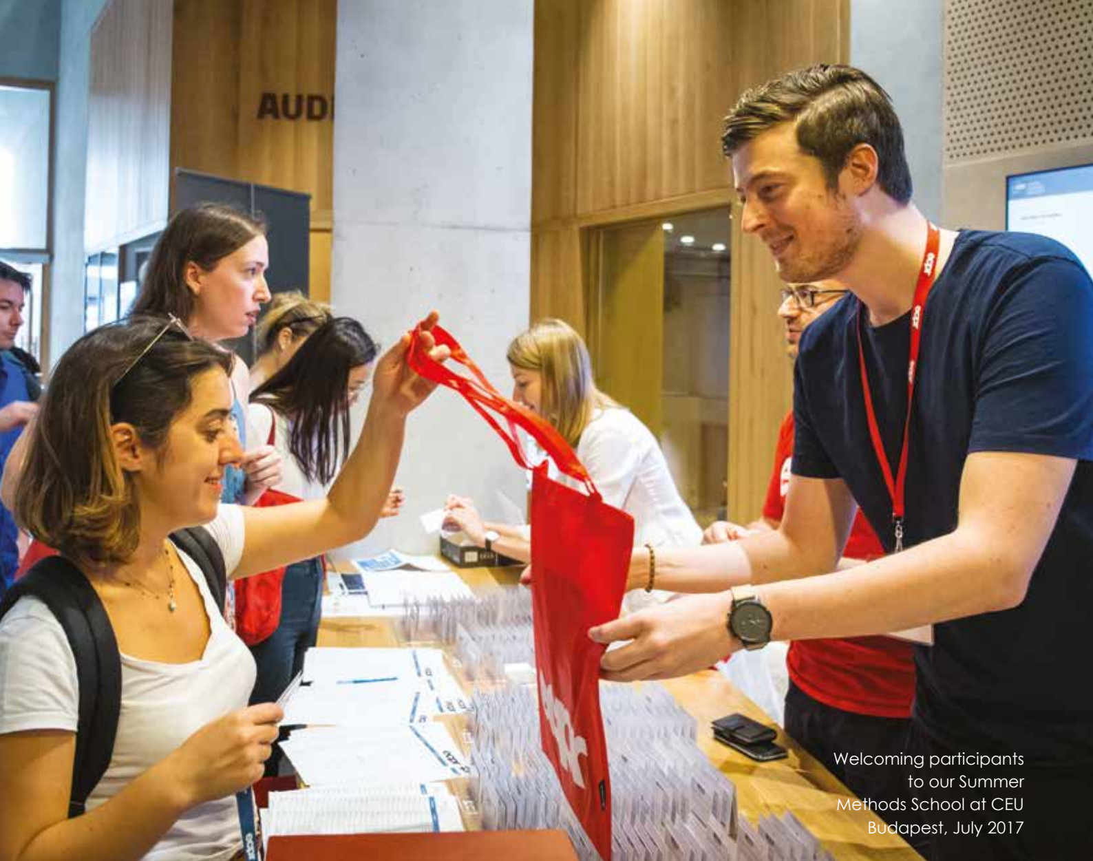
Welcoming participants to our Summer Methods School at CEU Budapest, July 2017