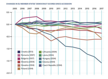
Fig. 1. Stagnation or decline of democracy in new EU member states since 2005.

EU political conditionality is expected to be most effective in countries midway along the democratisation path, with frontrunners not in need of additional encouragement and laggards not sufficiently receptive to external incentives (Vachudova 2005). Yet, it is precisely among the former high performers of the CEE enlargement round that democratic backsliding is most pronounced.